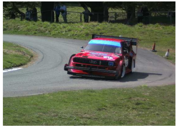
Neil and huge-winged Audi Quattro take slightly different lines