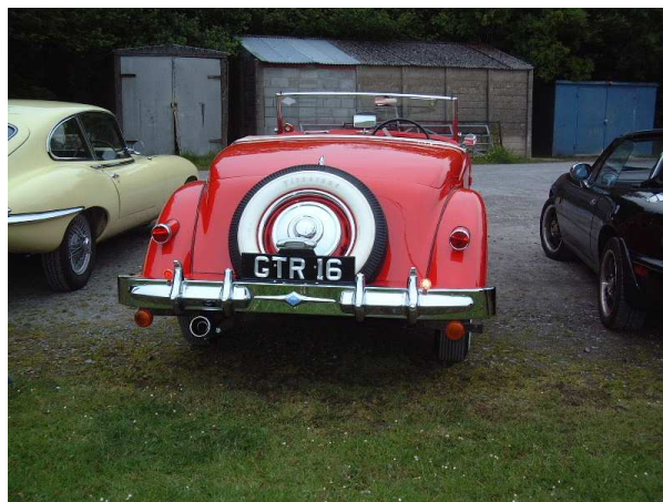
Very nice MGA and Riley (flanked by E type and MX5)